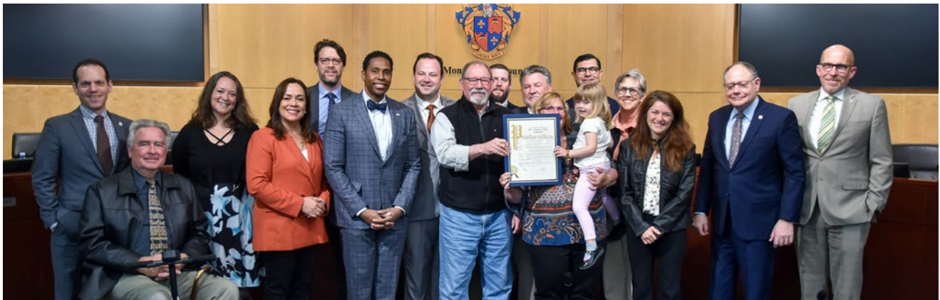
National Ag Day event was held in the County Council Chambers.